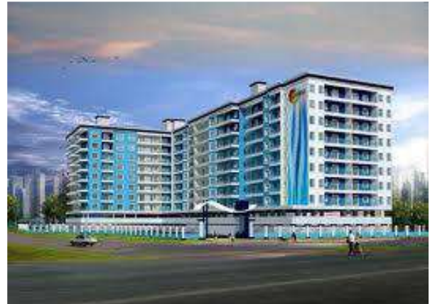
Figure 1: Studio Apartment