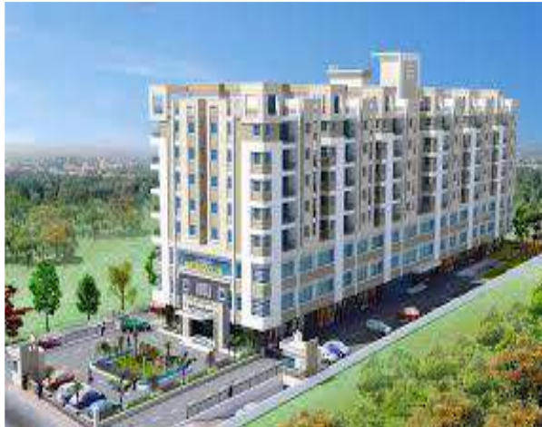
Figure 2: Garden Apartment

□ The implication is that there is a view of direct access to a garden from the apartment.